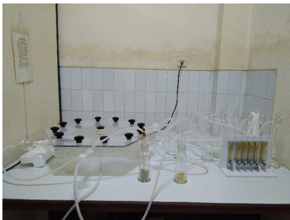
Figure 1. Six-arm insect olfactometer.